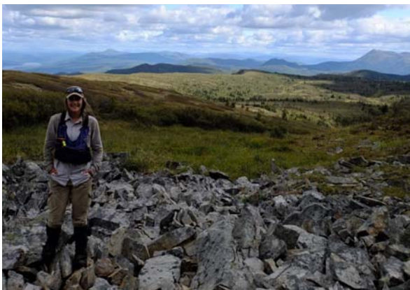
Poster Title: "Magmatic and metallogenic framework for Late Cretaceous magmatism in west-central Yukon"