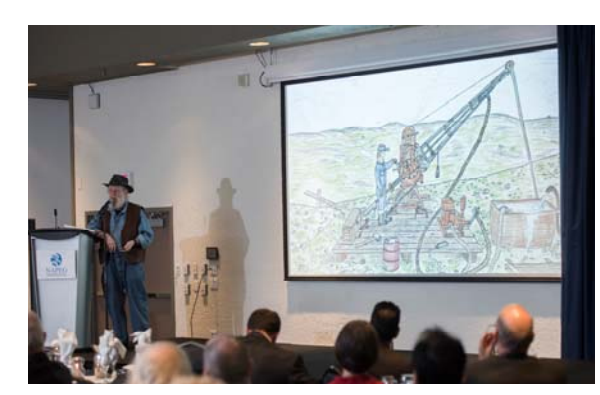
Entertaining his Audience - Great Presentation Style