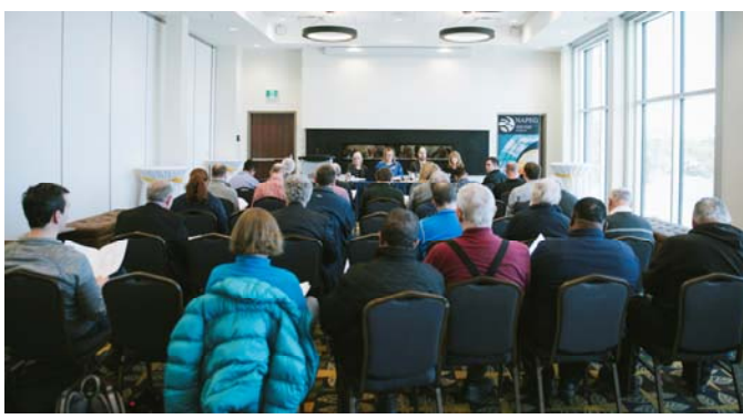
View from the Back of the Room