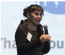
The Honorable Rosa Galvez, Ph.D., P.Eng. (QC) - Keynote Speaker and Senator