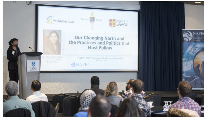
A few of the speakers and audience Day One of Professional Development