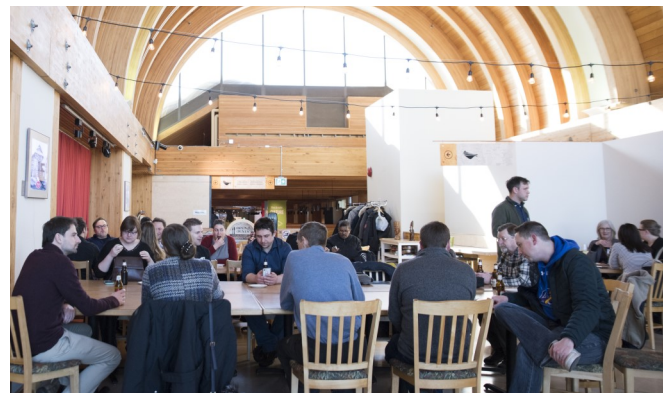
Three long days ended with a Members-in-Training Social and Tour at the Prince of Wales Museum.