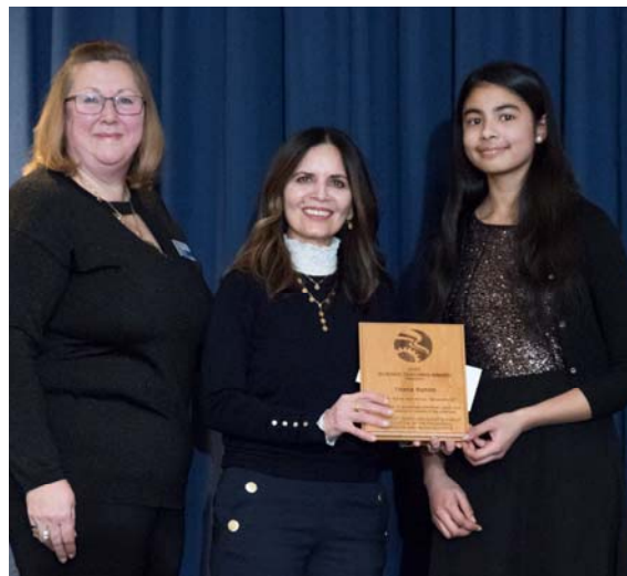
2020 Science Teaching Award

No nominations have been received for the 2021 Science Teaching Award.