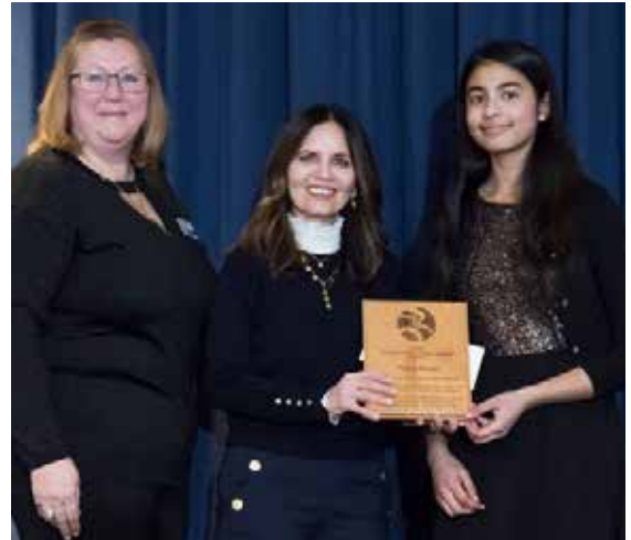
2020 Science Teaching Award